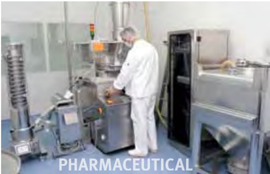
Pepperl+Fuchs' purge and pressurization systems support a wide range of plant floor PC-based process control solutions.