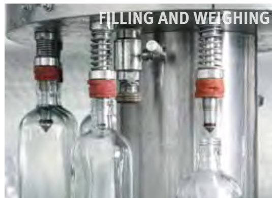
Weigh scale and filling equipment is typically located in or near the process area. Scales, filling, and printing equipment can be easily protected by a pressurized enclosure.

When purchasing from Pepperl+Fuchs you get more than a system. You also get our expertise and service. Our experts are available to assist with your application whenever and wherever you need it. We are The Leaders in Purging Technology®.