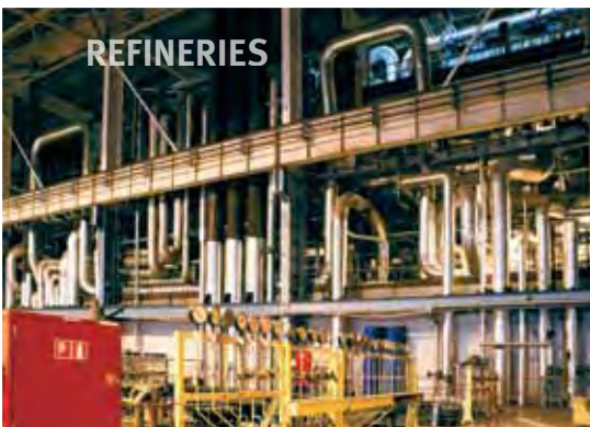
In hazardous locations, where flammable vapors, gases, and dust are present, Pepperl+Fuchs' 5000Q series helps prevent plant explosions.