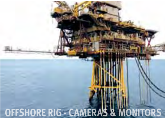
Security surveillance is possible in hazardous areas with an encased camera and Pepperl+Fuchs' purge and pressurization system.