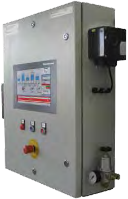
Compact and economical approach to operating equipment in a Zone 2 area