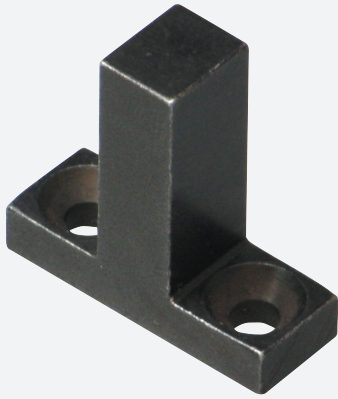
Damping element BT-F90-W

Damping element for sensors of type F90, F112, and F166; side hole