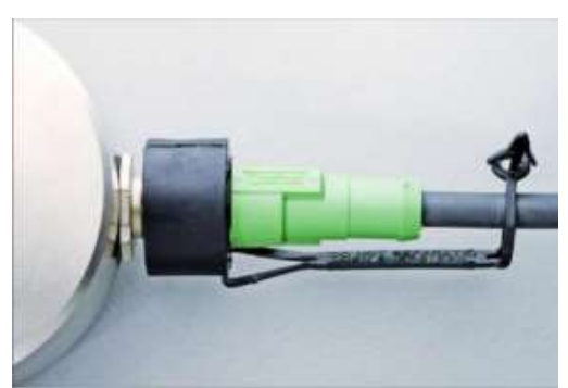
Fig. 2: Fastened Protective Cover