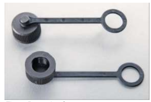
Fig. 3: Protective Cover