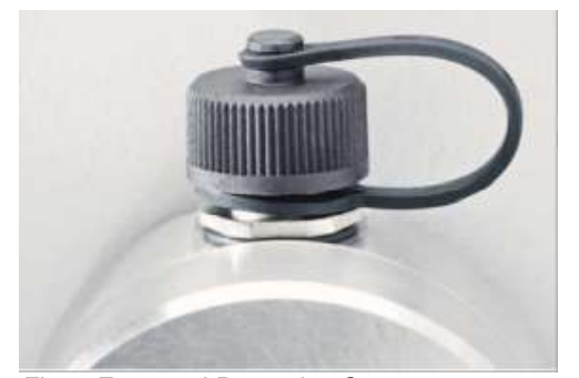
Fig. 4:Fastened Protective Cover