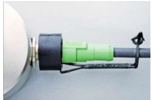
Fig. 2: Fastened Protective Cover