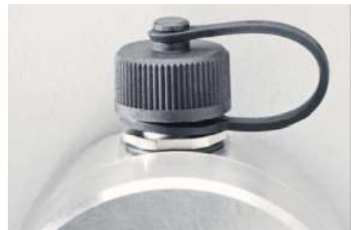
Fig. 4: Fastened Protective Cover