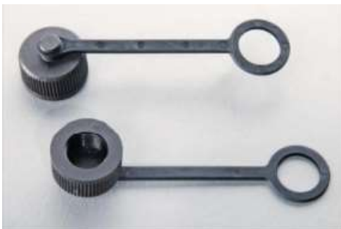
Fig. 3: Protective Cover