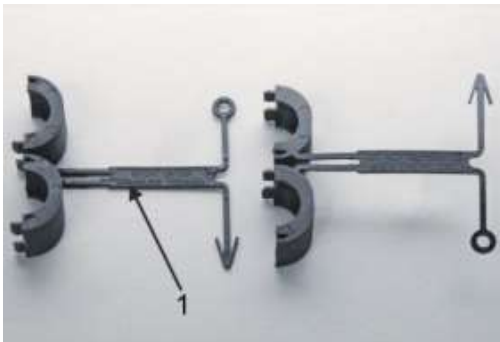
Fig. 1: Protective Cover 1 Notice sign