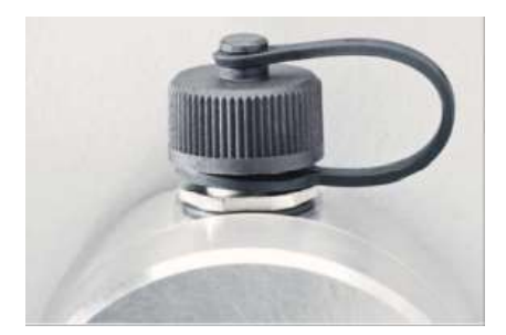
Fig. 4:Fastened Protective Cover