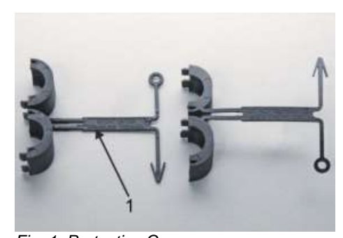
Fig. 1: Protective Cover 1 Notice sign