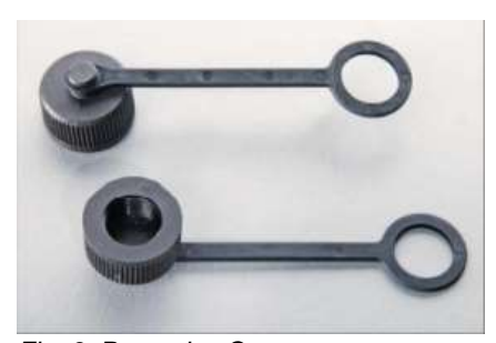
Fig. 3: Protective Cover