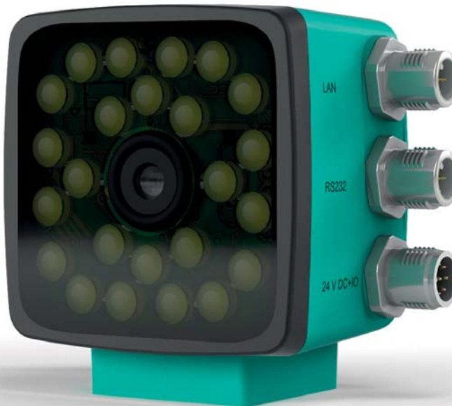
OPC120P code reader with polarization filter

Optical Identification for Letter Distribution Facilities