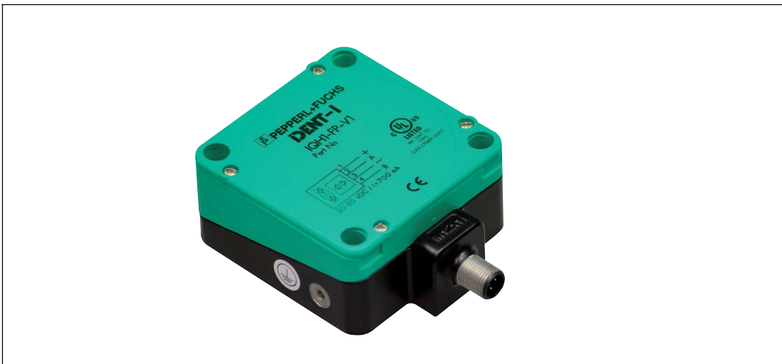
Figure 4.3 IQT1-FP-R4-V1