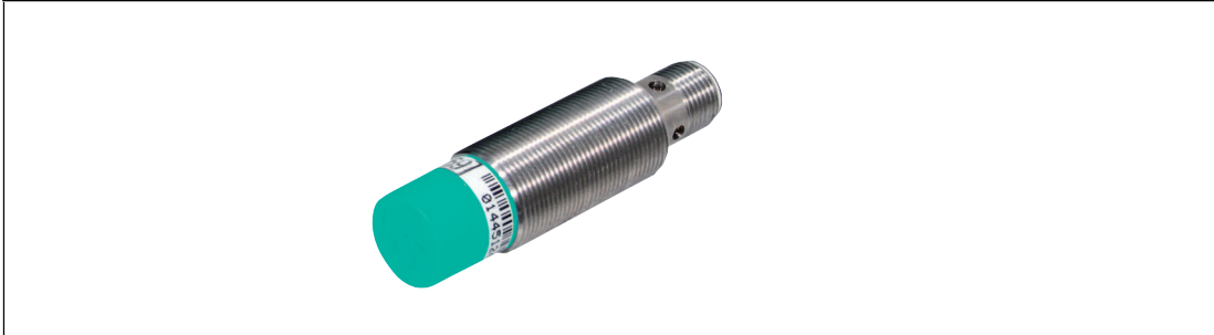
Figure 4.1 IQT1-18GM-R4-V1

These products are R/W systems equipped with a RS485 serial interface. The R/W systems write to and read from read/write tags in the 13.56 MHz frequency range. The devices are connected via M12 plugs.