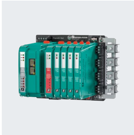
PROFIBUS Power Hub for four segments. Connects and powers field instrumentation with PROFIBUS PA