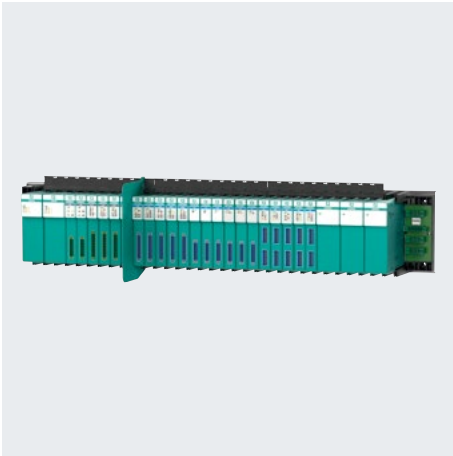
LB Remote I/O System