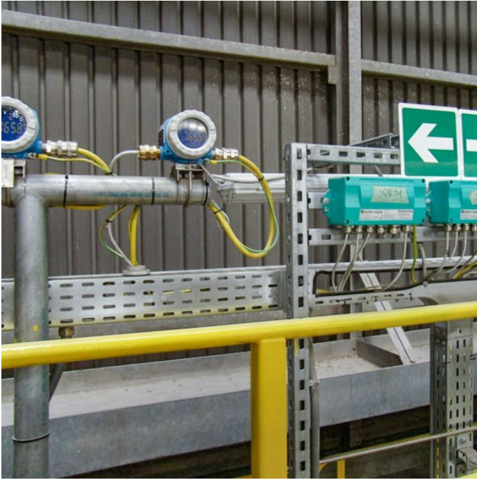
Simple connection of instruments via FieldBarrier in close proximity