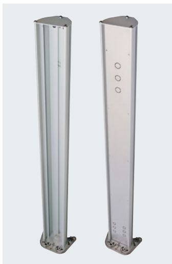
Bracket for floor mounting OMH-SLCT-100 and OMH-SLCT-110 (with back plane)

The deflection mirror and bracket for floor mounting are available in lengths of 1200, 1500, 2100, and 2500 mm.