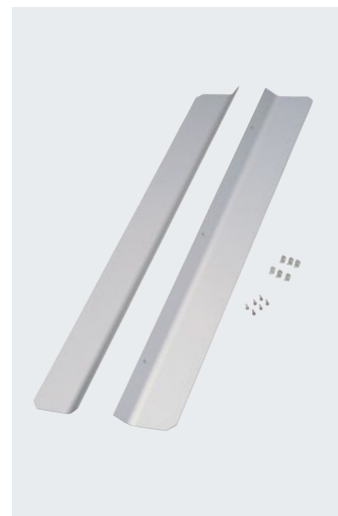
Side protection for mounting bracket OMH-SLCT-120