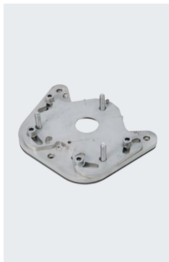
Floor mount for brackets and mirrors OMH-SLCT-200