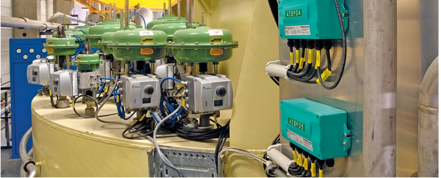
Segment Protectors with short-circuit protection for connecting devices: When working on a valve or measuring instrument, communication is protected, and with it the availability of plant operations.