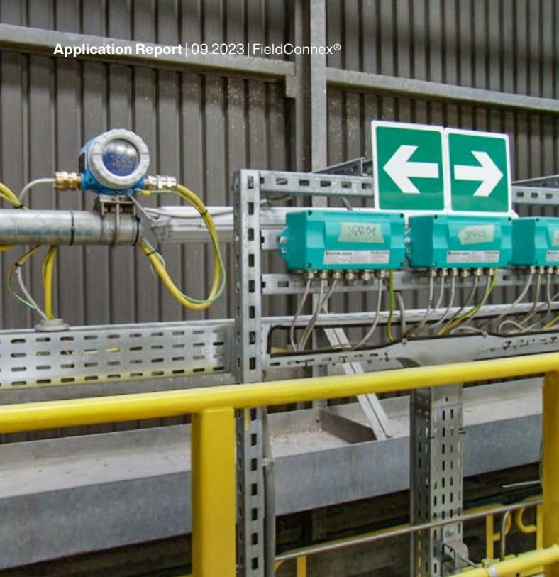
Simple connection of instruments via FieldBarrier in close proximity