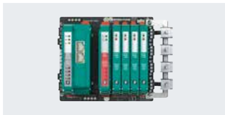
PROFIBUS Power Hub for four segments, connects and powers field instrumentation with PROFIBUS PA