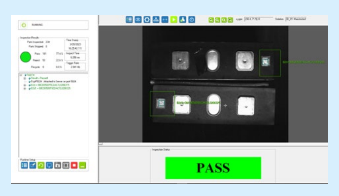
Identification of the battery cell via the Data Matrix code