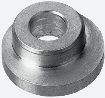
Synchro clamping element